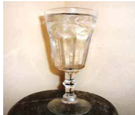
My delicious glass of ‘Torrance Tap’.