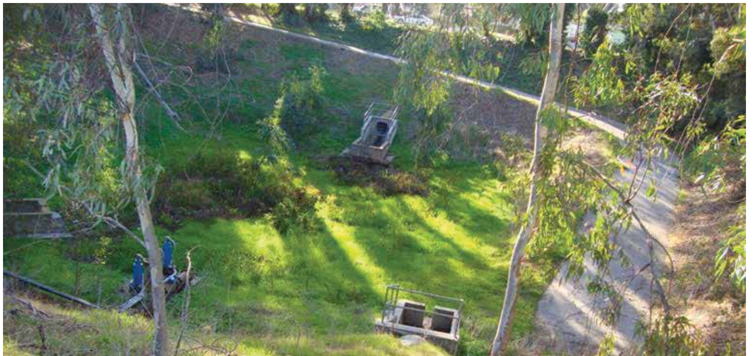
Don't worry! Yes, California is in a drought, but the City of Torrance is tops when it comes to water. (Pictured) The El Dorado Basin, which is one of 17 sumps in the city. Read more about Torrance's water management in "TerriAnn in Torrance", which starts below.