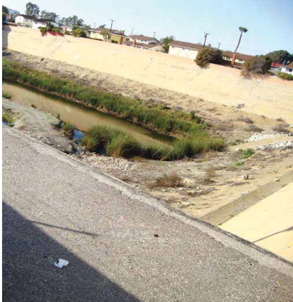
Amie Basin.

main water source companies are Torrance Water and Cal Water. If you live in Torrance,