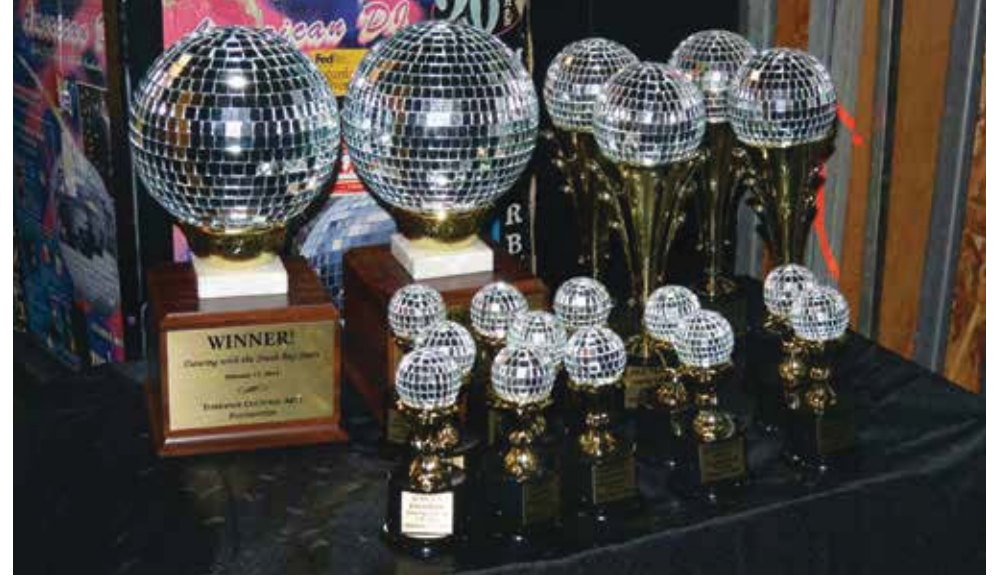
The Dancing With The Stars trophies are unpacked and displayed prior to the evening's dance competition.