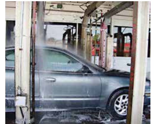
My car getting a bath.

from pesticides and herbicides, or inorganic contaminants like salt and metals that can result in runoff like if it rains on a rusty car and gets into the system. Water comes from storm clouds in the sky and anything it hits on its way to the ground is already a