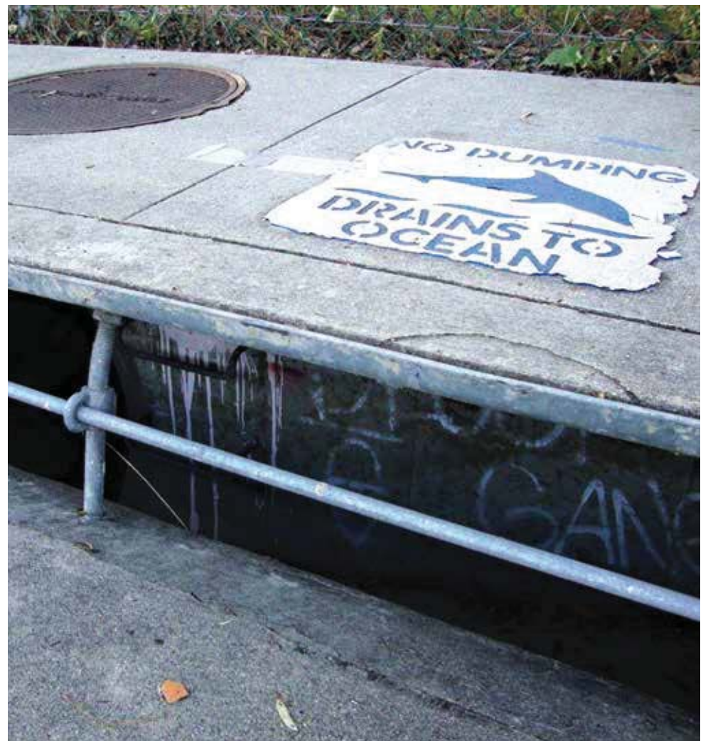
Water drains on Maple Avenue on the edge of the El Dorado Basin.

Thirsty yet? I am. After all this water talk I am going to get myself another glass of water and remind myself how very blessed we are to have clean, fresh water at our disposal. Oh, and by the way, my glass will be filled with Torrance Tap... •